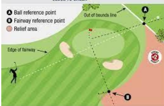
MLR E-5 DIAGRAM 3: BALL NOT FOUND OR OUT OF BOUNDS CLOSE TO GREEN

6. Technology Use: Cellular Telephone and Pager Use: In the spirit of Rule 1.2 of the USGA Rules of Golf, except for summoning emergency help (e.g. heart attack, heat stroke, fire, notifying the Pro Shop of a dead cart or for slow play where there is greater than one hole open in front of the slow play group) on the course, cellular telephone use is strongly discouraged during a stipulated tournament round. Exceptions are areas such as in or within 50 feet of the clubhouse complex, inside on-course rest rooms or in the course parking lot and only when you are not interfering with or delaying play (see interfering with or delaying play (see rule 5.6.)) Pagers should also be silenced or put on vibrate.